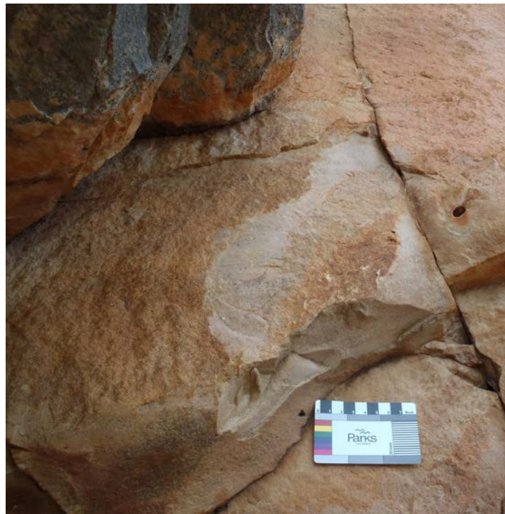
Scars on a rocky outcrop where stone has been quarried