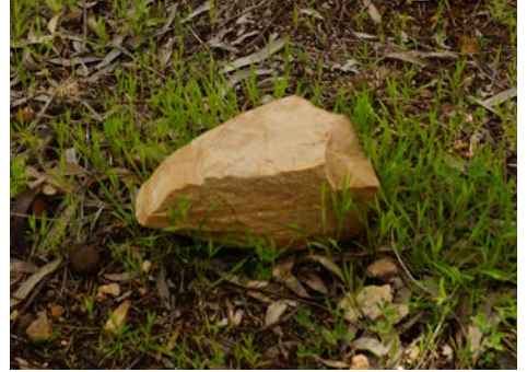
Quarried stone at tool manufacture site