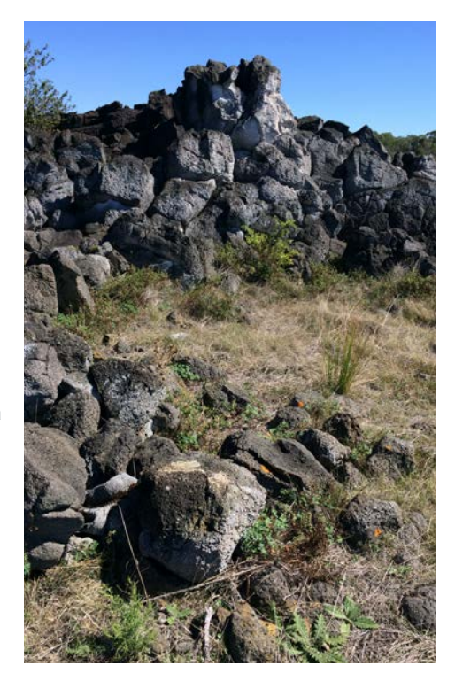
Foundation of stone structure