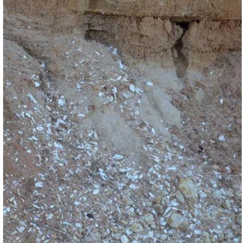
Eroding freshwater mussel midden