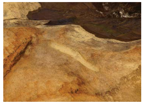
Axe-grinding grooves Axe-grinding grooves