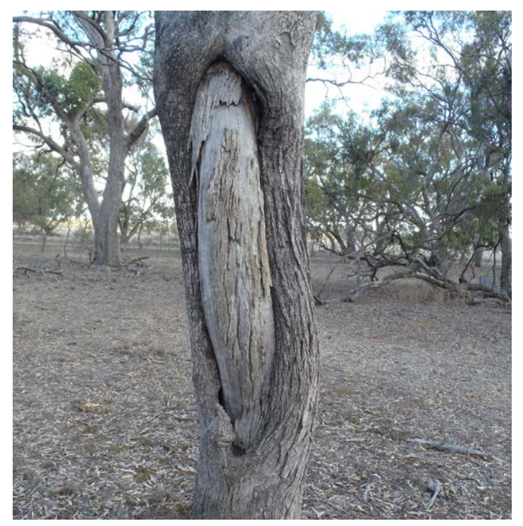
Culturally modified tree