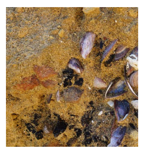
Beaked mussel and charcoal