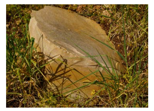
Stone quarried from outcrop