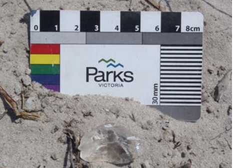
Chrystal Quartz flake