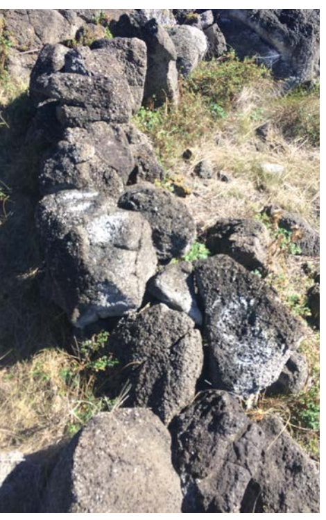
Foundation of stone structure