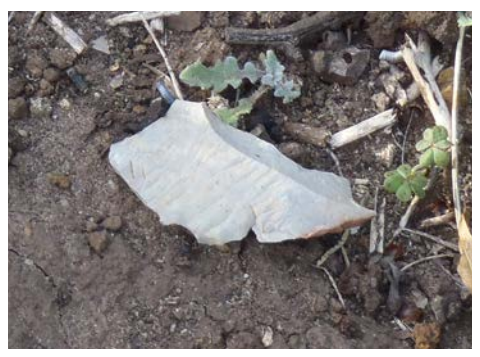
Angular fragment of a flake from tool production