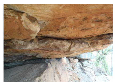
Scars on a rock shelter where stone has been quarried