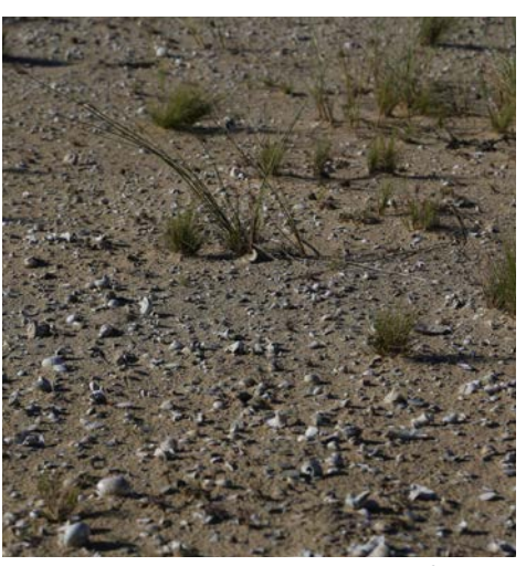
Operculum, Limpet, pipi, Turban, stone artefact