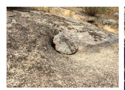
Rockwell with lid

Wurdi Youang is a stone arrangement on Wathaurung Country. It is a shaped arrangement of about 100 stones. There are three stones at one end of the arrangement that are believed to align with the sunset during the winter and summer solstices' and the Equinox. Its exact function is unclear and the date of construction is not known; however, it is possible that it is many thousands of years old.