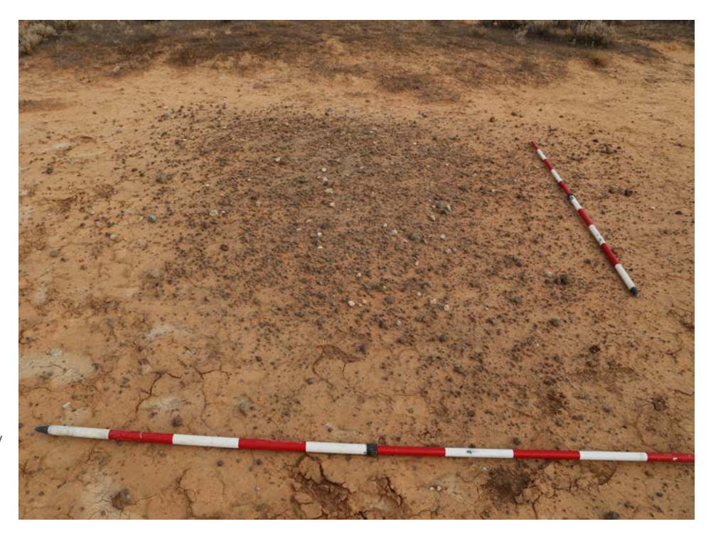
Hearth including burnt clay heat retainers

Aboriginal people had sophisticated methods for manipulating the landscape for the purposes of land and natural resource management dating back many thousands of years. In some cases, this technology pre-dates similar engineering found in ancient sites like Mesopotamia.