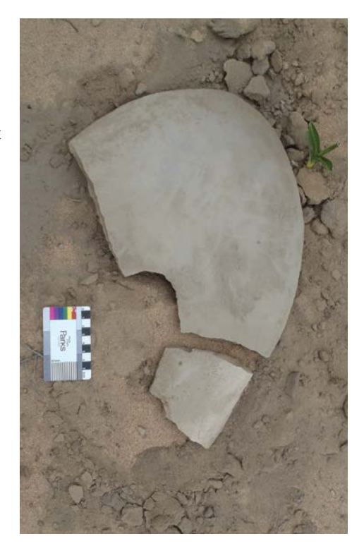
Lower grinding stone - damaged by cattle

Due to their large size and enormous weight, grinding stones were often left at places such as camps, where they were used regularly over many generations. Some grinding stones can be quite small; others can be very large or have multiple grinding grooves. Some may even be used on both sides of the grinding stone.