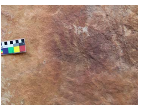
Red ochre hand print Red ochre figure Red ochre hand stencil

Gariwerd, The Grampians National Park, has the largest number of known rock art sites in southern Australia – more than 80 per cent of Victoria's known rock art sites. Approximately 60 shelters, containing more than 4,000 different motifs have been identified in the national park<sup>18</sup>.