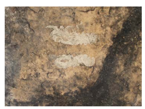
White ochre lines