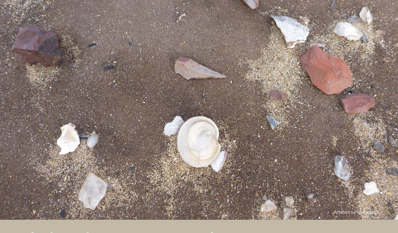
Flaked stone tools