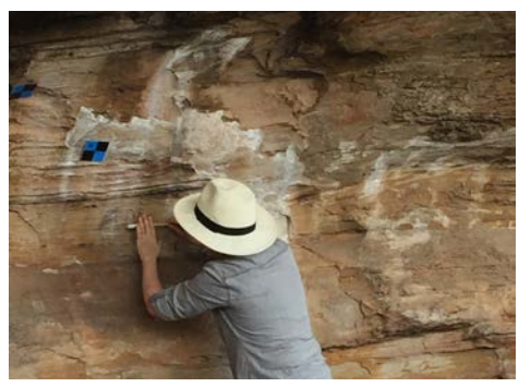
Bunjil's shelter Graffiti removal