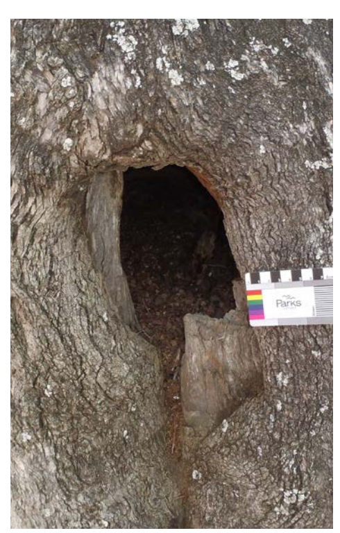
Culturally modified tree Burnt culturally modified tree Smoke hole