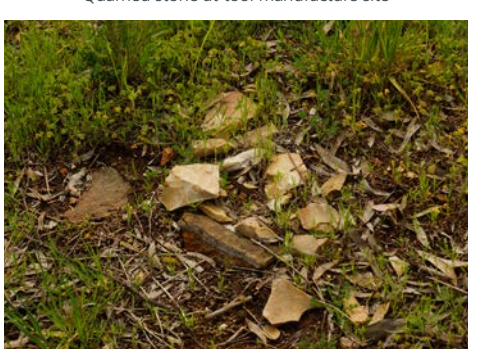
Quarried stone at tool manufacture site