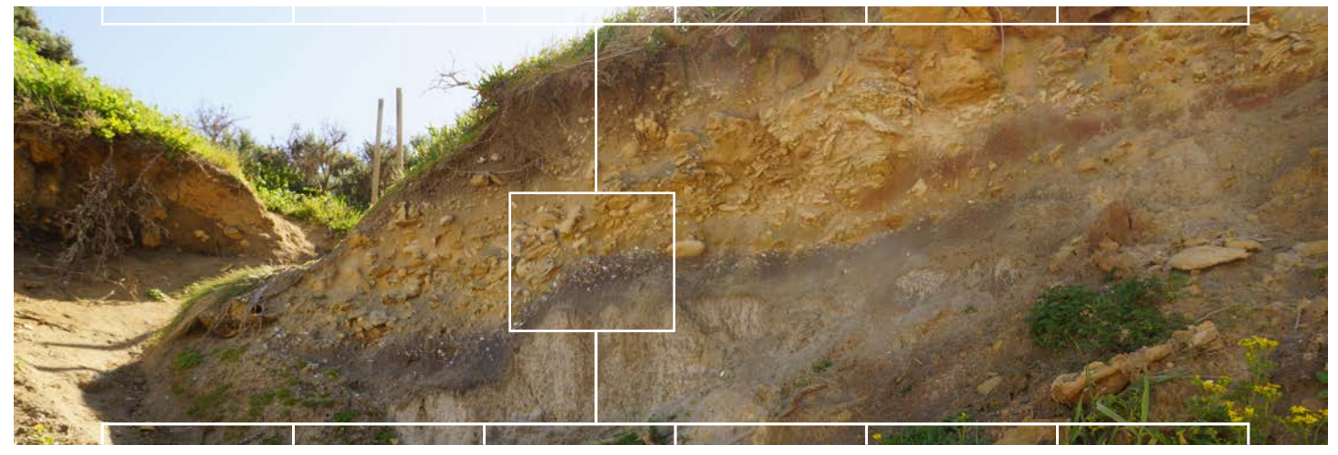
Limpet and Turban shell