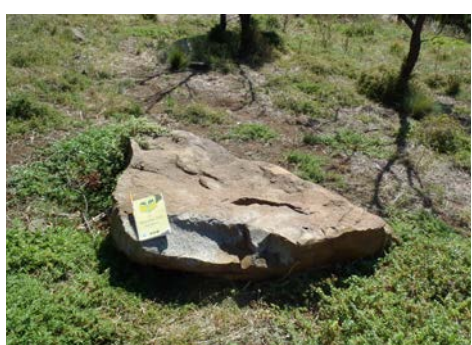
Stone guarried from outcrop