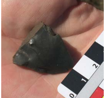
Flint point, dorsal surface showing bulb of percussion near proximal end