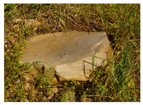
Stone quarried from outcrop