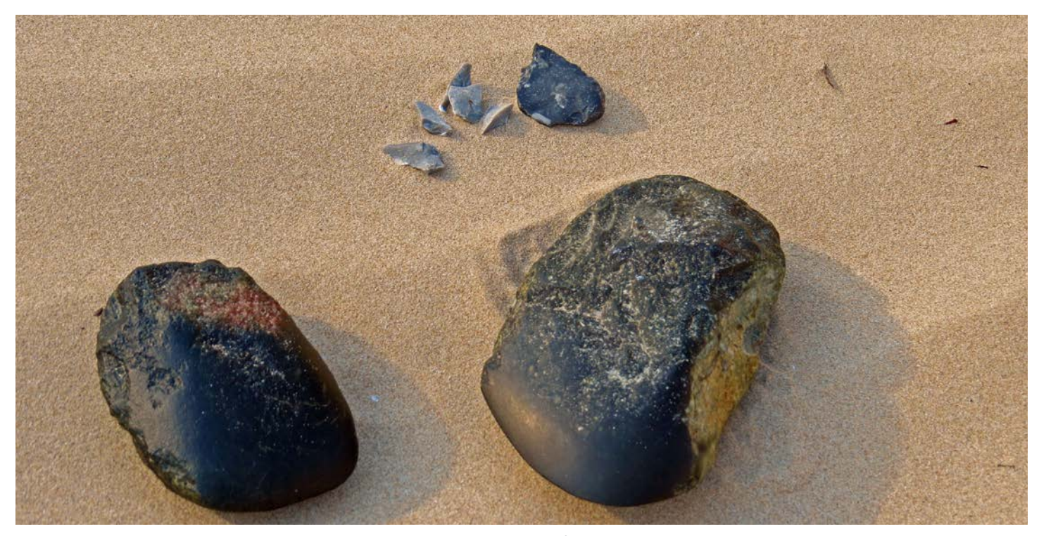
Stone axes and artefacts