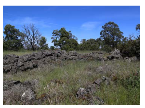
Foundation of stone structure