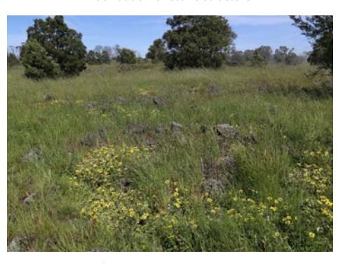
Foundation of stone structure, Gunditjmara Country