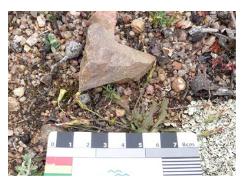
Quartzite microblade core

The thick bases of bottles were flaked and worked into tools, which have been found in many parts of Victoria and across Australia<sup>6</sup>. Metal items such as horseshoes were heated and reworked to form spear points and knives<sup>7</sup>. In many parts of Australia, Aboriginal people still make and use stone tools for use in everyday activities.